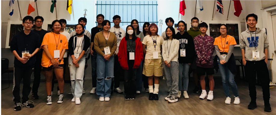
Exhibit Tour: "Race: Are we so different?"